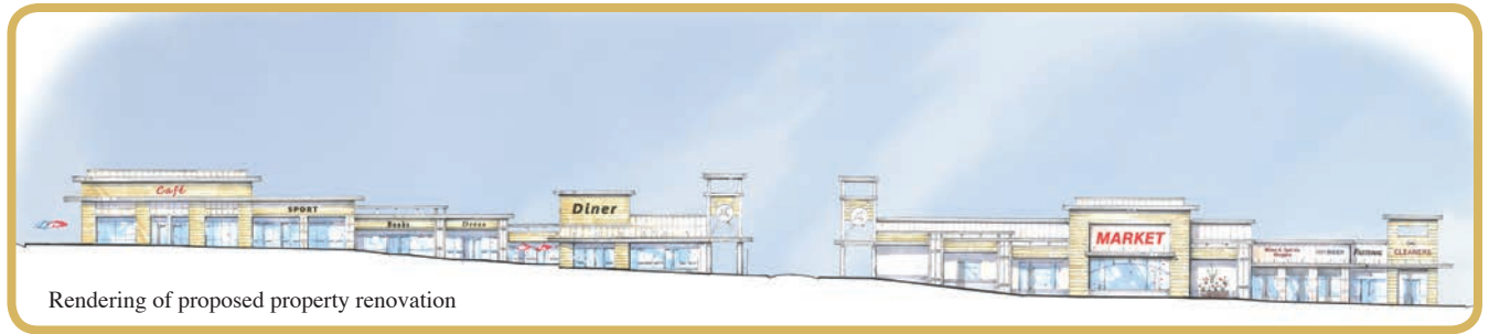
Rendering of proposed property renovation

2850 Audubon Village Drive Eagleville, Pennsylvania